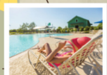
Resort style pool